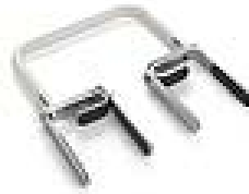
Tub security rail